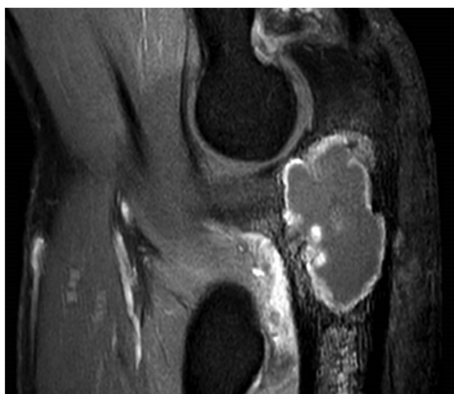
Figure 2 Magnetic resonance imaging scan with gadolinium contrast.

treatment using wide excision is necessary to achieve clean margins. 16,20 The patient was planned for marginal resection of the tumor and reconstruction with a novel hemiarthroplasty technique using a custom-made proximal ulna, the 3D-printed prosthesis type MUTARS (Modular Universal Tumor And Revision System; implantcast, Buxtehude, Germany).