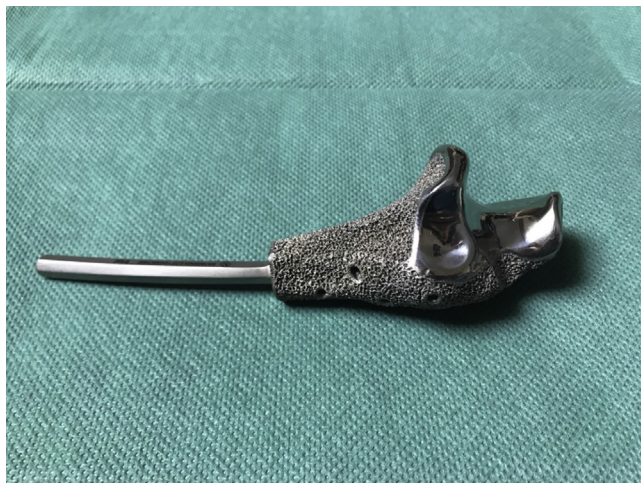
Figure 4 3D-printed model of trial prosthesis.