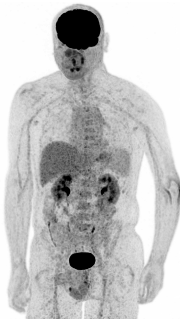
Figure 5 Technetium FDG PET/CT scan at 2.5 years postoperation.

Pathology report confirmed the diagnosis of grade II chondrosarcoma with wide margins of 25 mm to resection plane and 5 mm distance to the joint. In the following months, the patient recovered painlessly, with 140/10° flexion/extension and 80/50° pronation supination at the 18-month follow-up, and 140/30° flexion/extension and 90/70° pronation/supination at 2 years. Elbow function remained the same at 2.5 years' follow-up. Conventional radiographs (Fig. 1) showed an adequate position of the prosthesis with no signs of loosening or wear of the remaining joint although a developing lucent zone is seen at the distal anterior zone of the ulnar stem. FDG PET/CT scan confirms the absence of loosening (Fig. 5). Active extension of the elbow is still limited at