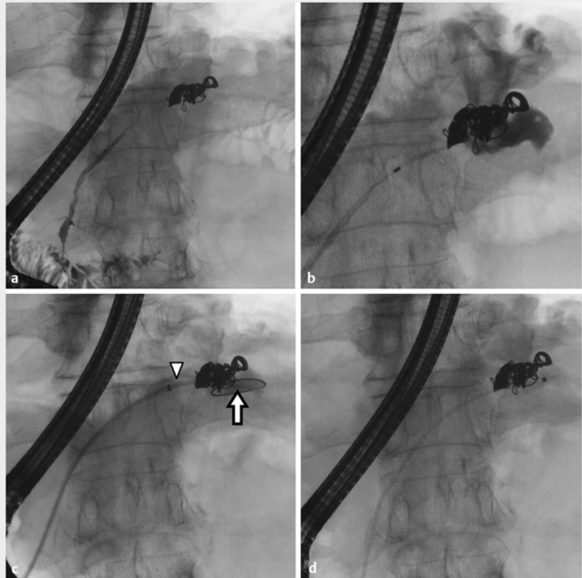
► Fig. 2 Fluoroscopic images of a 70-year-old man. a Tight ductal strictures in the pancreatic body. b A pancreaticopleural fistula upstream of the strictures. c A device delivery system advanced beyond the strictures. Arrow, tip of the inner catheter of the device delivery system; arrowhead, tip of the outer sheath. d A nasopancreatic drainage tube was successfully placed beyond the strictures.

A 70-year-old man presented with epigastric discomfort. He had undergone a transarterial coil embolization of a splenic artery pseudoaneurysm 3 months previously. Computed tomography revealed an effusion extending from the pancreatic tail towards the mediastinum, with an accompanying pleural effusion (► Fig. 1 ). Endoscopic retrograde pancreatography revealed severe ductal strictures in the pancreatic body (► Fig. 2 a ) and a pancreaticopleural fistula upstream of those strictures (► Fig. 2 b ). We then managed to advance a long-tapered catheter beyond the strictures; however, we were unable to pass a nasopancreatic drainage (NPD) tube through the strictures. Therefore, we next opted to perform a “tunneling technique” using a novel device delivery system (Endo-Sheather; Piolax Medical Devices, Kanagawa, Japan). The device delivery system consists of an inner catheter that tapers to a tip of 3.9Fr diameter within an outer sheath (6.2Fr inner diameter), which enables devices of up to 5.7Fr diameter to successfully pass through tight strictures. Thus, we advanced the delivery system over a 0.035-inch guidewire to dilate the