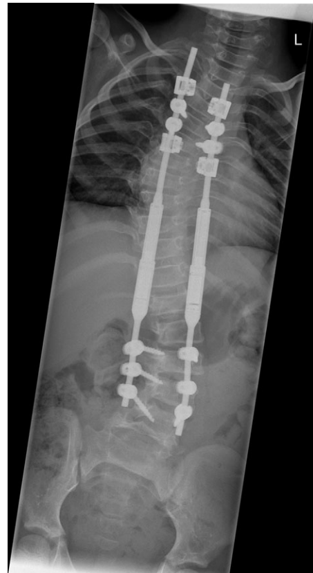
Figure 2: An immediate post-operative whole spine radiograph demonstrating the spinal construct with the MCGR rods (measuring 38° in the thoracic curve and 30° the thoracolumbar curve with a T1–S1 height of 247 mm and a T1–T12 height of 160 mm).