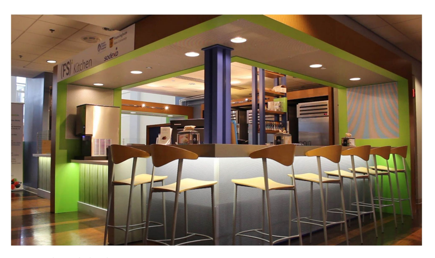
FIGURE 2 Framingham State Food Study kitchen.

items. Additional SAS programming allowed for automatic substitution of menu items in production sheets, according to the master list, with items that maintained the macronutrient composition of the meal. The food service team reviewed each production sheet before food preparation and flagged any meal that contained a substitute menu item. The flag was an additional alert for food service staff to be extra vigilant. This system maximized participant safety, without compromising differentiation between diets.