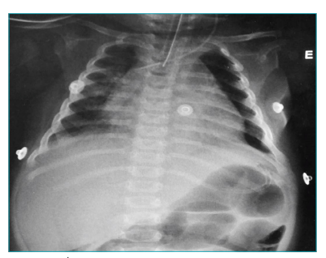
Figure 1 Chest x-ray.

A previously healthy 6-months-old female infant was referred to the Pediatric Intensive Care Unit of the Clinics Hospital of University of Campinas (CH-UNICAMP) because of a coma. Fifteen days prior to the coma, the patient had presented respiratory symptoms and had received antipyretics and short-acting B2-agonists. Four days prior to the coma, the patient presented respiratory distress and a fever, and was admitted to a secondary hospital in the metropolitan region of Campinas, São Paulo, Brazil. On the first day of hospitalization, the patient had a persistent fever and sinus tachycardia. A chest X-ray revealed an increased cardiac area with no radiographic changes in the lungs (Figure 1). The following day, an echocardiography revealed pericardial thickening with bulky effusion and signs of cardiac tamponade. The patient was reported to