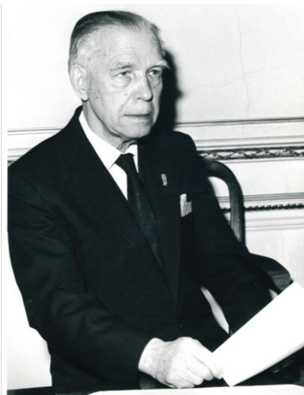
Figure 5. Stanisław Ostrowski President of Polish Republic on Exile on the day of presidential oath and taking an office of the Head of the State on 9th April 1972.

medical biochemistry, Professor Ion Manta (1900-1979) [79]. Although Stanisław Ostrowski and Ion Manta were great academic teachers, it was a great luck for both of them to save their own lives under communist regime [79]. As shown in the discussion, due to a great life story of Stanisław Ostrowski, the professional biography of Stanisław Ostrowski has been worth profound biographical studies for a number of reasons. Our current original historical paper presents so far the most complete, grounded on primary resources, thoroughly checked within secondary resources, biographical study on Stanisław Ostrowski. The authors of the paper aimed to provide a medico-historical analysis of the life of Stanisław Ostrowski in ethical, socio-economic and cultural aspects, as these perspectives are always pivotal in an academic approach of the history of medicine [80].