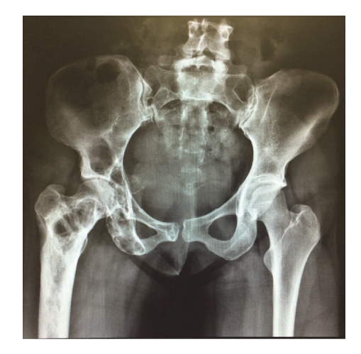
FIGURE 3: Hip Rx at age 27. Lesions in the iliac bone and right femur compatible with fibrous dysplasia.

FD is characterized by the development of fibrous bone lesions that replace normal skeletal structures. Abnormal fibroblast proliferation and defective osteoblast differentiation result in the replacement of cancellous bone and marrow