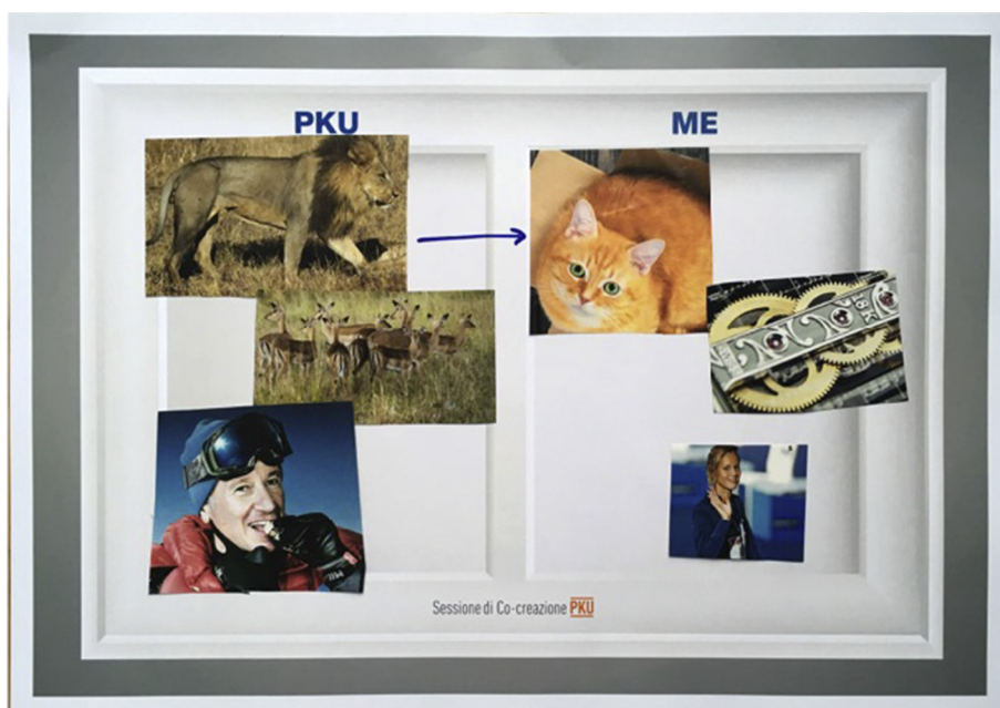
Fig. 2. Exemplar image of the co-creation exercise ‘PKU & me’ on the emotional experience and attitudes of non-adherent PKU patients.

In fact, one of the most oppressing problems seemed to be related to the possibility to travel safely and autonomously (travel meaning any place outside familiar local territory): participants reported a strong difficulty in managing the diet outside the home due to the fact that the information about the nutritional values of foods are often difficult to find and calculate. Other difficulties involving the diet management emerged: protein-free foods are available only in pharmacies; restaurants are not prepared for the provision of protein-free food. Another aspect that emerged is the perception of being obliged to continuously plan life. Simple things like where to have lunch but also bigger decisions like a pregnancy, (the female members of all three teams referenced and understood the need to plan pregnancy to avoid fetus