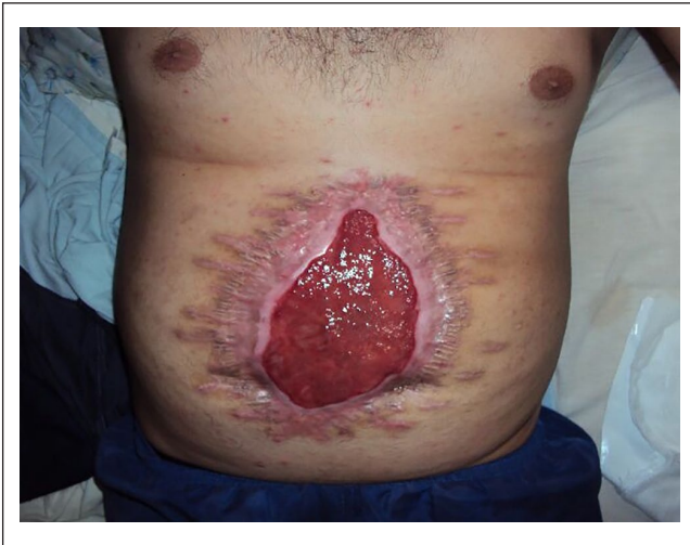
Figure 1. Granulation tissue before the skin graft.