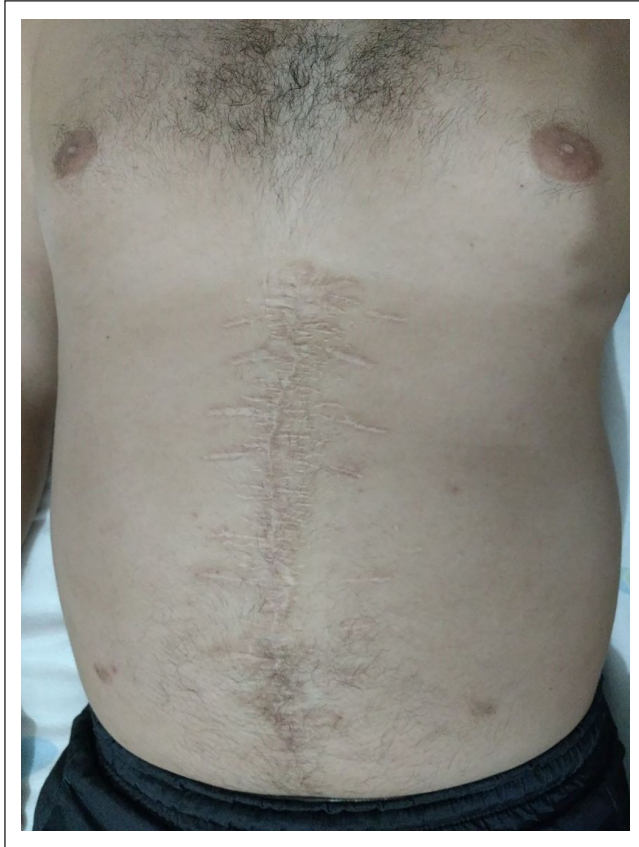
Figure 5. Late post-op of the ventral hernia.