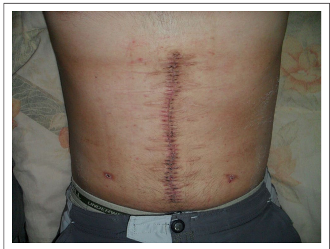
Figure 4. Immediate post-op of the ventral hernia.

that “he wasn’t able to stay shirtless due to shame,” as well as “not performing any physical activities due to fear of increasing the size of the hernia or causing other injuries.”