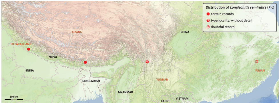
Figure 13. Distribution of Longizonitis semirubra (Pic).

spatulate in female, male external metatibial spur as similar as female, inner one stick-like and only half width of external one; tarsomeres in both sexes without pads; protarsi evidently longer than protibiae, protarsomeres longer than wide; teeth on ventral margin of dorsal blade of tarsal claws present only in basal half on outer row.