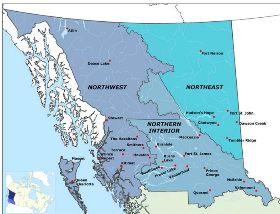
Figure 1. Map of Northern British Columbia

Northern health. Northern Health is, geographically, one of the largest multi-site regionalized acute care and community healthcare systems in North America. It is one of five regional and one provincial health authorities in BC, all established in 2001. The First Nations Health Authority (FNHA), formed in 2012, oversees health services provided in First Nations communities throughout the province. Northern Health is responsible for acute care, long-term care, home and community care, public health, and mental health services throughout the region. Northern Health employs 7,000 people in 24 acute care facilities, 14 long-term care facilities, public health units and other specialized service teams organized within three health service delivery areas. Most physicians and many allied health professionals are not employees of NH. Northern Health contracts with many community-based support services and care