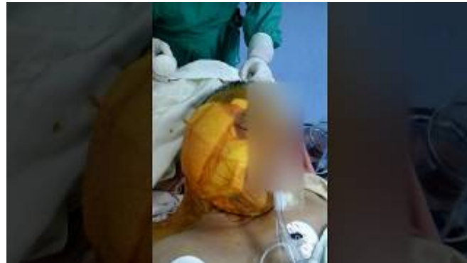
VIDEO 1: Case 2 video showing NPWT dressing suction maintained.