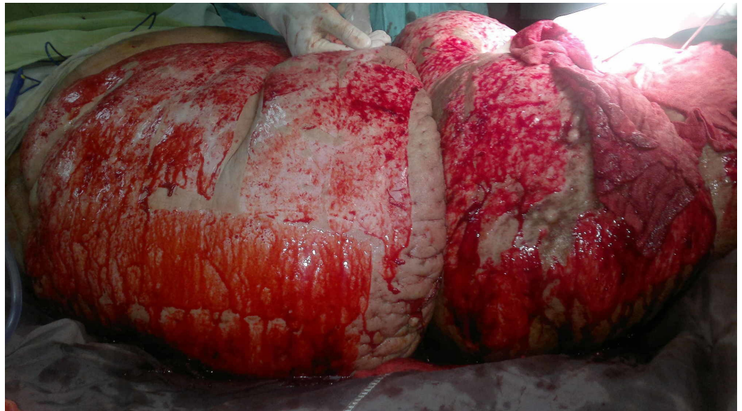
FIGURE 10: Case 3 picture showing skin graft taken at the start from same limb for later use.