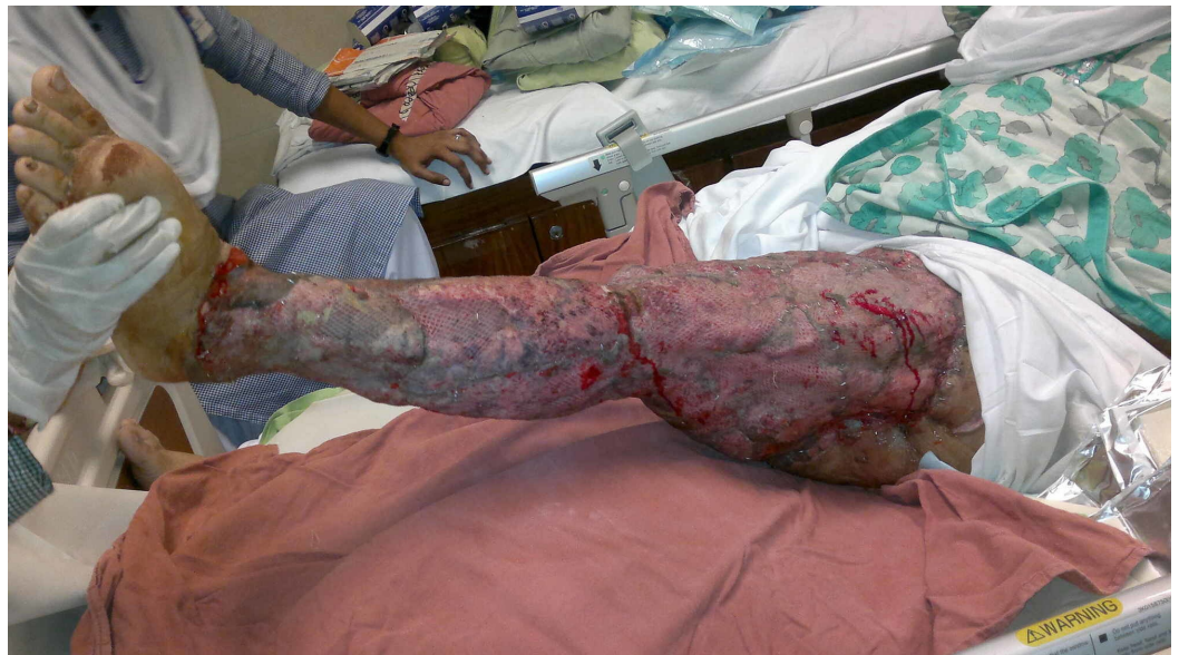
FIGURE 13: Case 3 picture showing NPWT dressing removed after 48 hours. Skin graft is well taken.