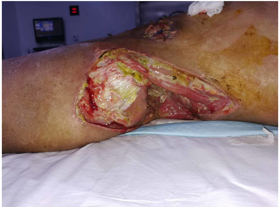
FIGURE 1: Case 1 is a 24-year-old young male presented with history of gun shots to abdomen and groin region, leading to necrotizing fasciitis.