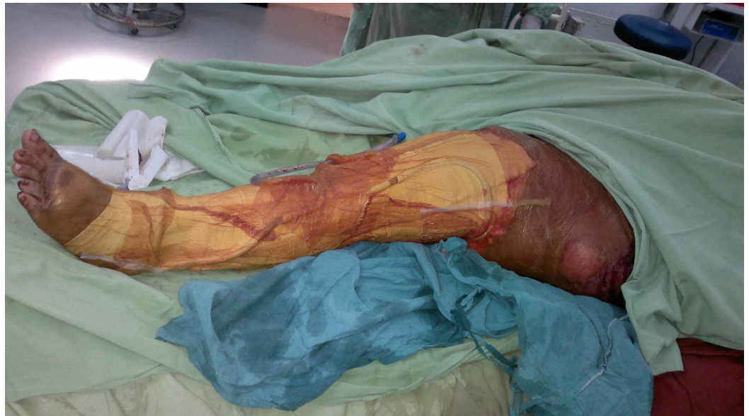
FIGURE 12: Case 3 picture showing well sealed large NPWT dressing over skin grafted wound.