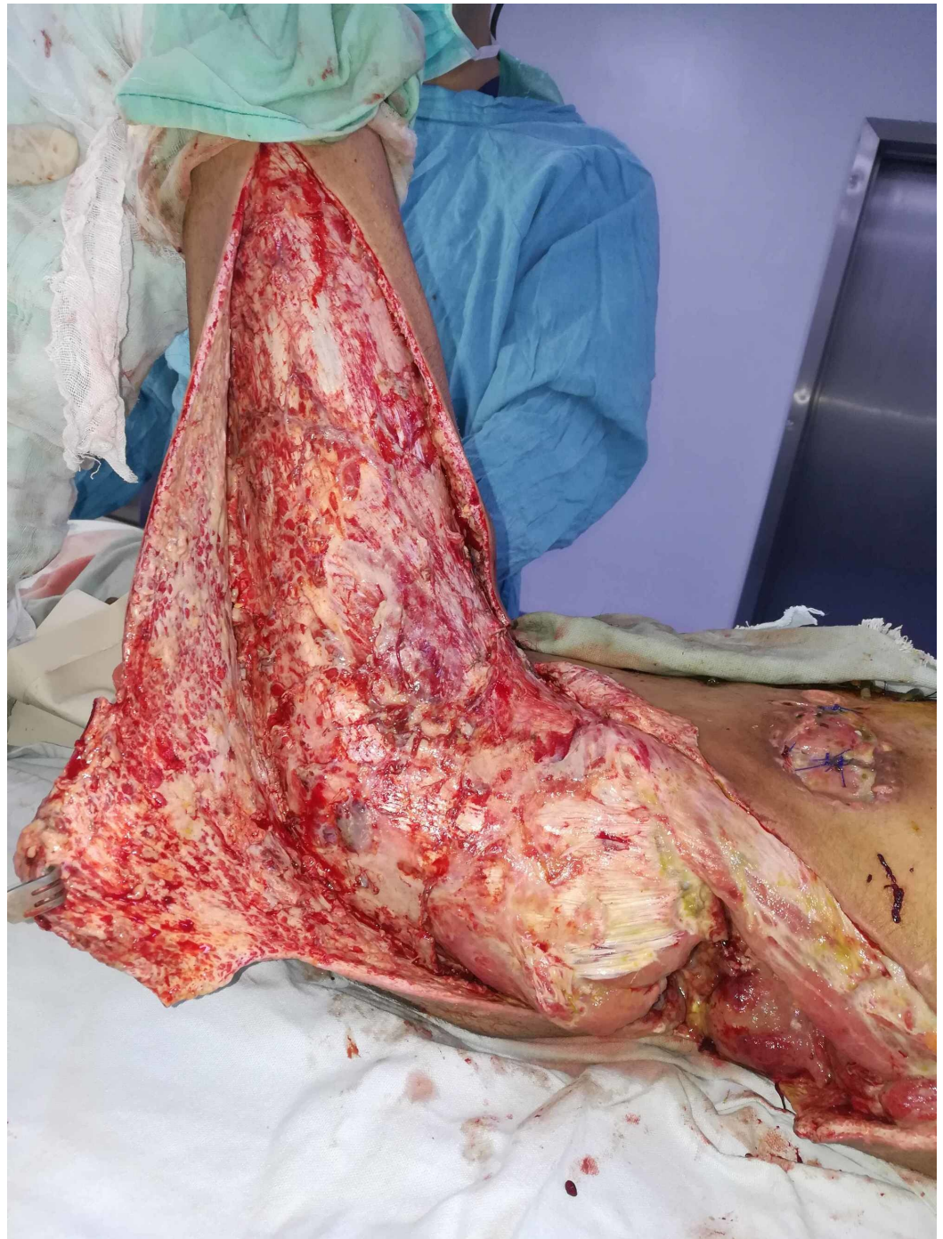
FIGURE 2: Case 1 picture showing extensive debridement done for removing the necrosed tissue.