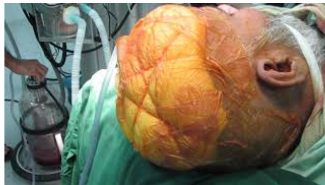
VIDEO 3: Case 4 video showing large NPWT dressing applied to skin graft over scalp wound.