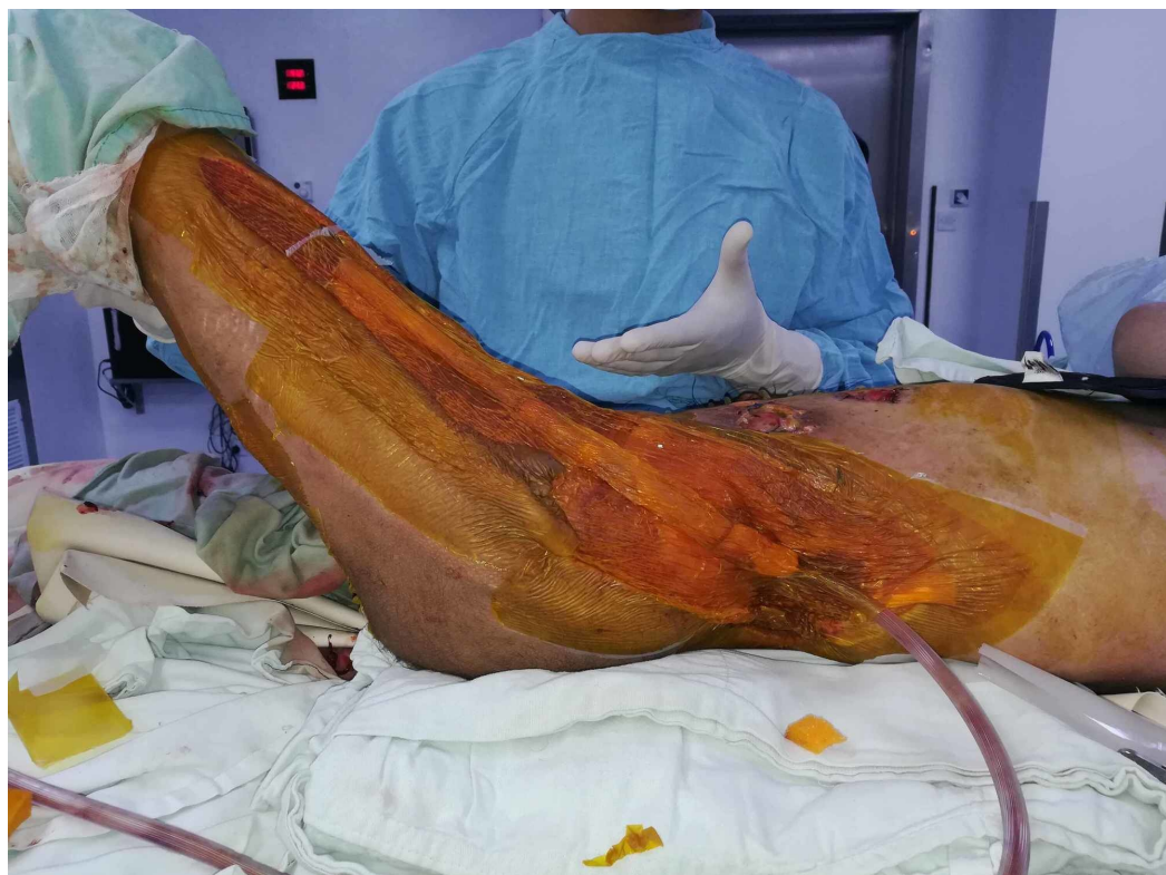
FIGURE 3: Case 1 picture showing a large NPWT dressing is applied to left thigh and groin region, dressing partially buried inside wound.