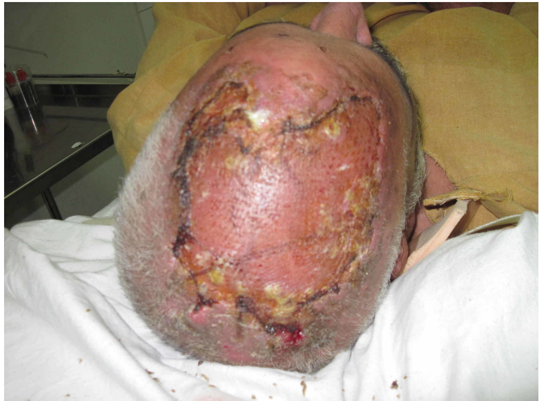
FIGURE 18: Case 4 picture showing nicely taken graft and healed wound in subsequent follow-up.