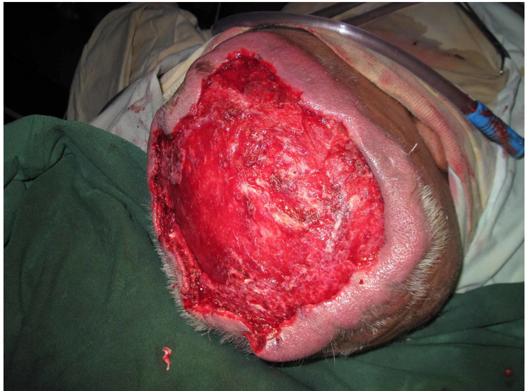
FIGURE 15: Case 4 picture showing immediately after 2nd session of debridement, wound ready for coverage.