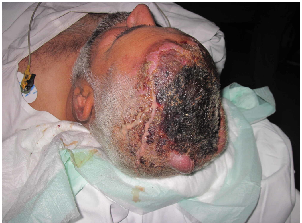
FIGURE 14: Case 4 picture showing a 40-year-old male with history of lightning strike to head presented with large necrosed area of scalp.

Case 4 (Figures 14-18) (Video 3) is a 40-year-old male presented with an infected wound of scalp after lightning strike. He had multiple debridements done. NPWT dressing was applied over skin grafted wound. He has nicely taken skin graft seen at follow-up pictures.