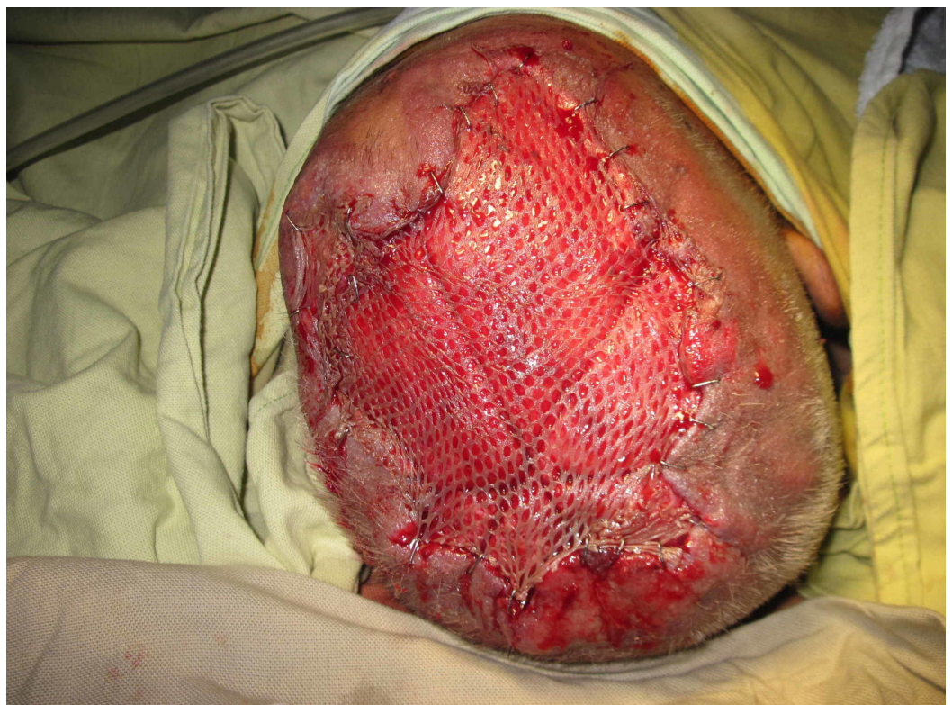
FIGURE 16: Case 4 picture showing skin grafting done which is dressed with NPWT dressing.