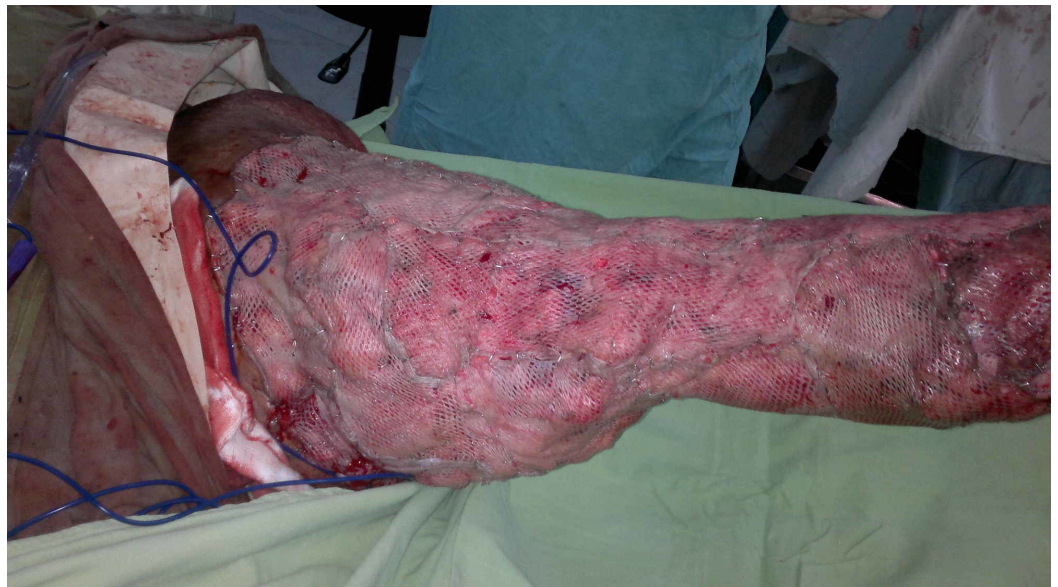
FIGURE 11: Case 3 picture showing Charles' procedure done. Skin graft taken at first stage is used to cover the whole limb.