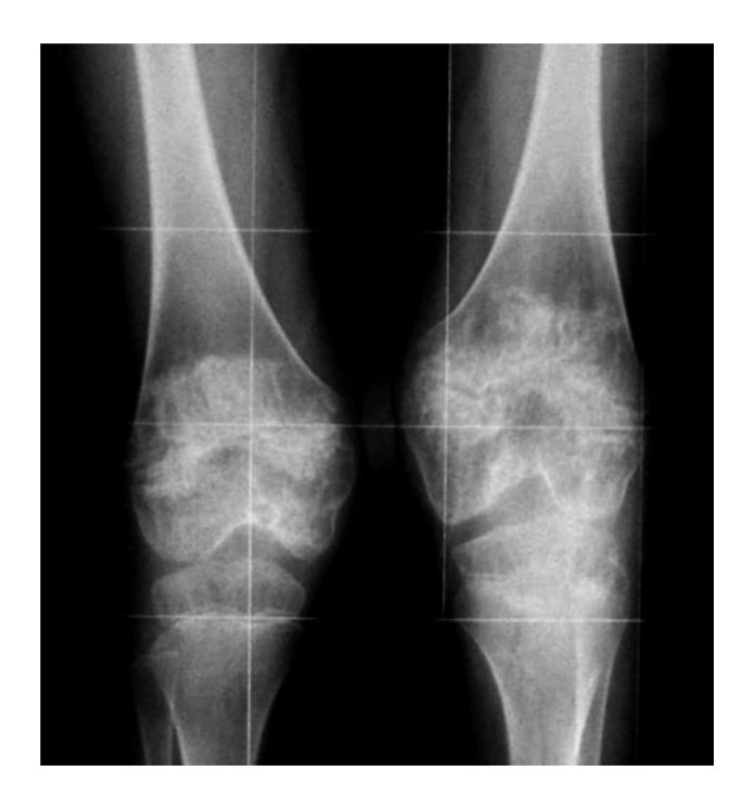
Fig. 1. Anteroposterior radiograph of the knees performed at 7 yr of age (before starting anakinra treatment). The radiograph displays the unique skeletal feature of NOMID, which is believed to be the expression of abnormal endochondral bone growth, mainly affecting large joints and long bones. Mass-like calcified lesions separated from the metaphysis by well-defined borders are visible in the physis of the distal femura.

sc injected every day) was started in combination with 0.1 mg/kg methylprednisolone on alternate days at 7 yr of age. After only 1 wk of anakinra treatment, dramatic improvement was evident in all clinical signs and laboratory findings, including urticaria-like rash and acute-phase reactants, which became normal for the first time in his life (5). Despite these improvements, growth was poor, with a height of 104 cm (-3.47 SD) and weight of 17.4 kg (-2.44 SD). NOMID-specific imaging of the knees revealed mass-producing lesions in the physis of both femora (Fig. 1).