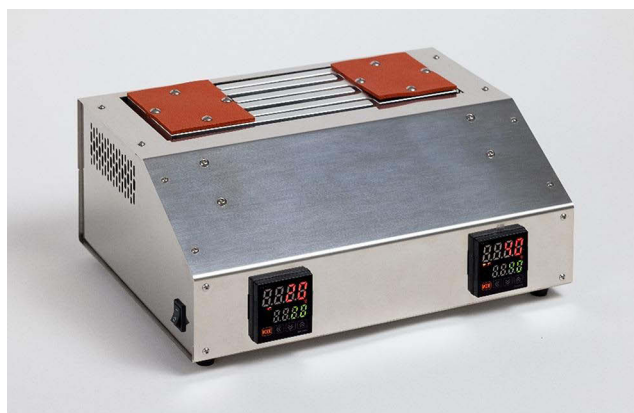
Figure 1 Image of the thermal grill device.

The thermal grill was designed and manufactured by Anatz (Seoul, Republic of Korea) according to previous validated studies (Figure 1). 21–23 The device used for generating the TGI consists of two parts: a control unit and thermal bars. The temperatures of the cold and hot bars were controlled and recorded using a digital thermometer. The temperature of each bar was generated by Peltier elements and finely controlled by the settings of the control unit. The temperature of the cold bar was set to 20\pm 2 °C and that of the hot bar was set to 40\pm 2 °C. A grill consisting of six 12-mm wide and 120-mm long