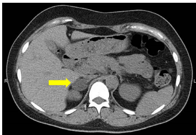
FIGURE 1 Computer tomography on postpartum day 3 (The yellow arrow shows a 28 mm × 28 mm right adrenal mass.)

ranged between 130-140 and 90-100 mm Hg with antihypertensive therapy (Nifedipine 40 mg/day). The 24-hour urine total protein level was checked few times and showed normal data (198.0-293.2 mg). We suspected preexisting hypertension. Hormonal profiles revealed a normal serum cortisol level of 15.5 (normal range 4.5-21.1 µg/dL) and a low plasma