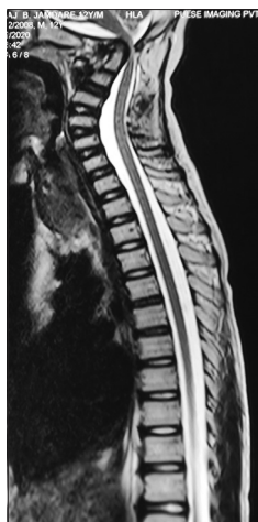
Figure 2: T2-weighted MRI showing Group A basilar invagination, external syringomyelia and external syringobulbia. MRI - Magnetic resonance imaging

of posterior longitudinal ligament, and Hirayama disease. [19-21] Long-standing atlantoaxial instability can be associated with multisegmental subaxial spinal instability in these cases. One or more “secondary” and protective alteration can be associated in such cases. The presence of external syringomyelia can be indicative of segmental spinal instability. On some occasions, external syringomyelia can be a sole indicator of presence of spinal instability.