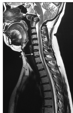
Figure 1: T2-weighted sagittal MRI showing Group B basilar invagination, Chiari formation and external syringomyelia. MRI - Magnetic resonance imaging

More recently, we identified central or axial atlantoaxial instability in cases with myelopathy related to multisegmental cervical spinal degeneration, ossification