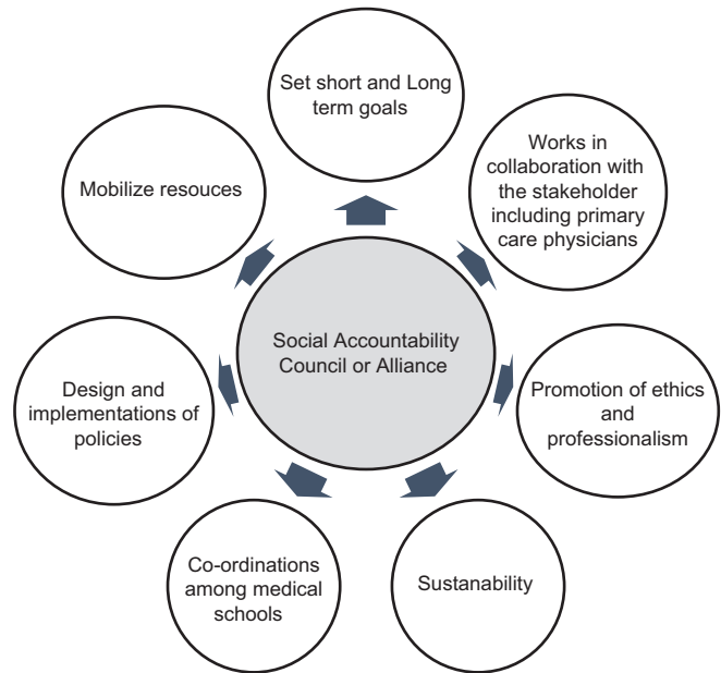
Figure 2: Gives a brief summary of the proposed functions and duties of the social accountability alliance