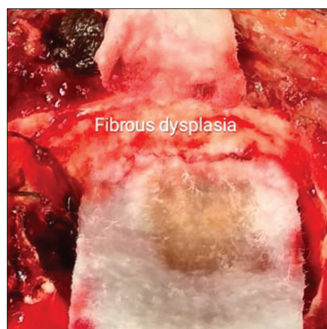
Figure 2: Intraoperative image showing thickened occipital bone

Approximately one-third of patients with fibrous dysplasia have involvement of cranial and face bones. These patients