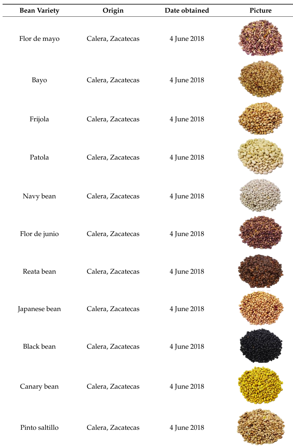
Table 1. Bean varieties selected in the state of Zacatecas to be studied.