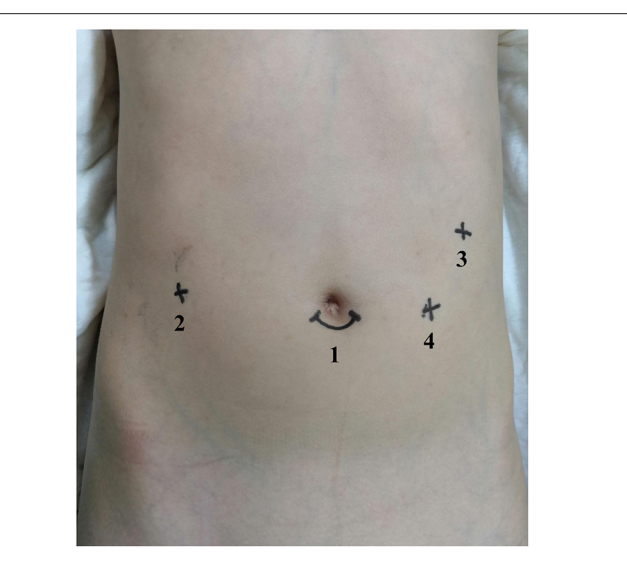
FIGURE 1 | Port placement in robot-assisted surgery for choledochal cysts. (1) Camera port. (2) Port I. (3) Port II. (4) Assistant port.

A gastric tube was first set in place for gastrointestinal decompression after general anesthesia had been induced. The patient's right upper abdomen should be raised with his/her head elevated 15^{\circ} with a left incline of 15^{\circ} . End-to-side anastomosis of the jejunum was performed extracorporeally with a 1.2- to 1.5-cm incision below the umbilicus, and the intestine was returned to the abdominal cavity. A 12-mm trocar was then set as a 3D endoscopic port at the subumbilical incision and constructing pneumoperitoneum with a 12-mmHg pressure ( Figure 1 ). With the use of images from the camera, two 8-mm trocars were placed in the right upper abdomen 5–8 cm away from the umbilicus and 4 cm below the front rib of the left axillary line. Following this, No. 1 and No. 2 arms were introduced, and a 5-mm trocar was placed between the endoscopic port and No. 1 arm as an auxiliary port. The ligamentum teres hepatis and the middle