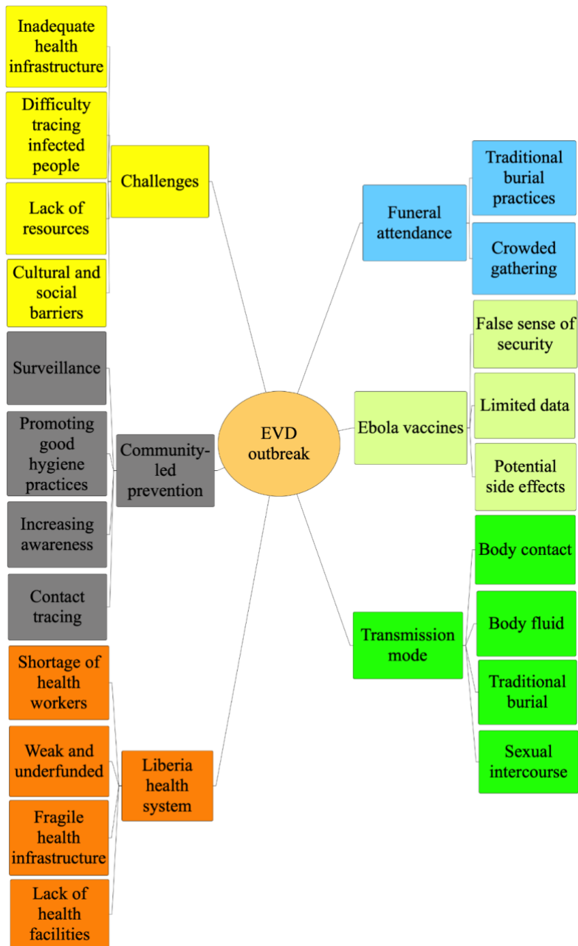
Figure 1 Themes and subthemes developed using NVivo 12 Plus

Some participants expressed the same thought in each theme, so only one representative quote and any participants who provided a similar thought are shown.