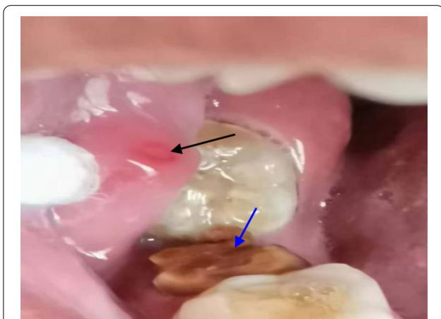
Fig. 1 The residual root (blue arrow) and the mildly erythematous edematous mucosa (black arrow)

From previous morphological characters and comparing them to literatures [5–8], the larvae were identified as the mature stage larvae of Clogmia albipunctata (Diptera: Psychodidae).