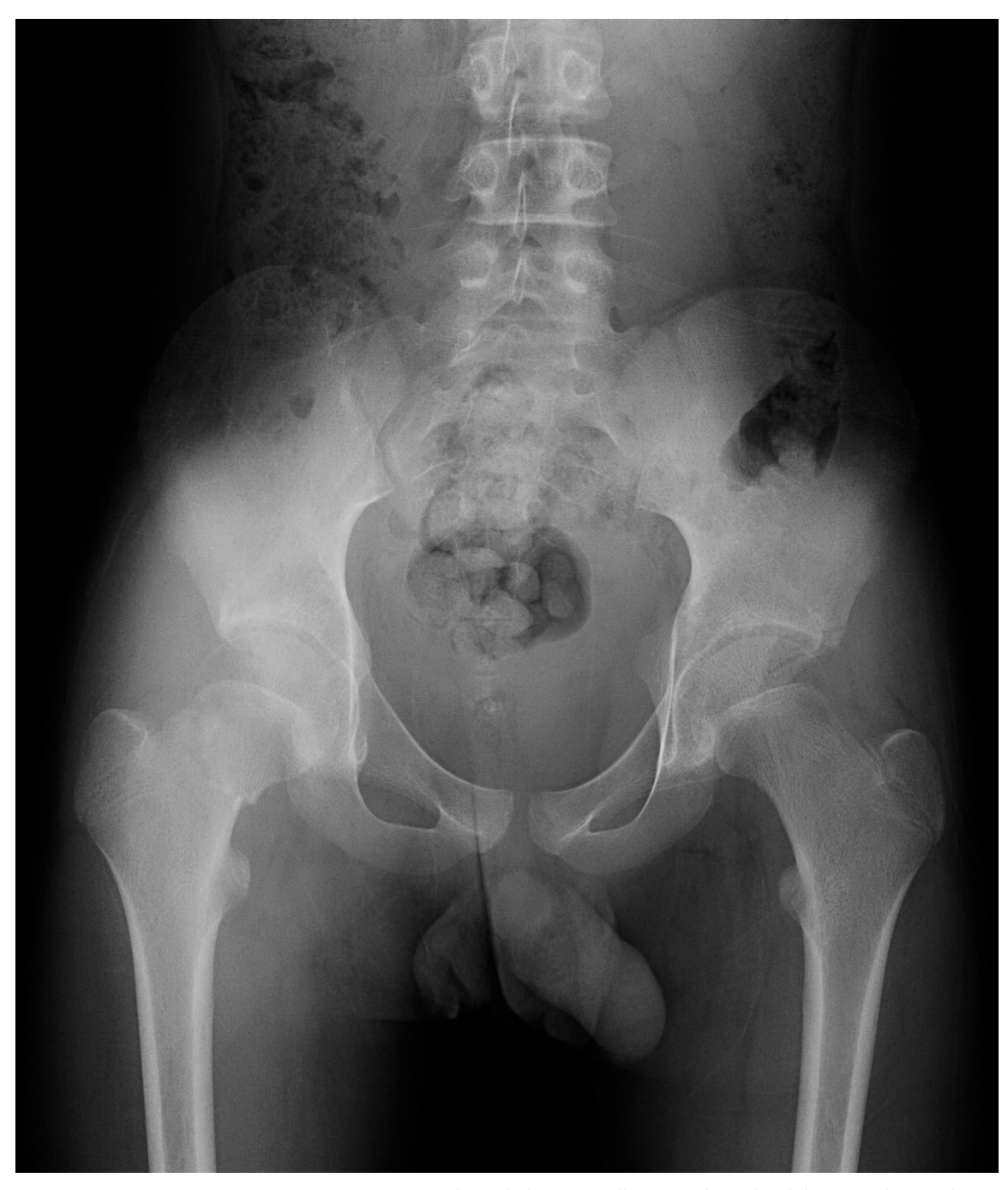
Fig 4. Fracture classification and displacement degree. Radiograph showing a Delbet type-II femoral neck fracture with insignificant displacement.

when the femoral neck fracture requires fixation across the epiphyseal plate, it is more important to ensure the stability of the fracture end than to protect the growth potential of the epiphyseal plate [5,29]. Therefore, all fractures in this study were fixed by cannulated screws, which are widely used.