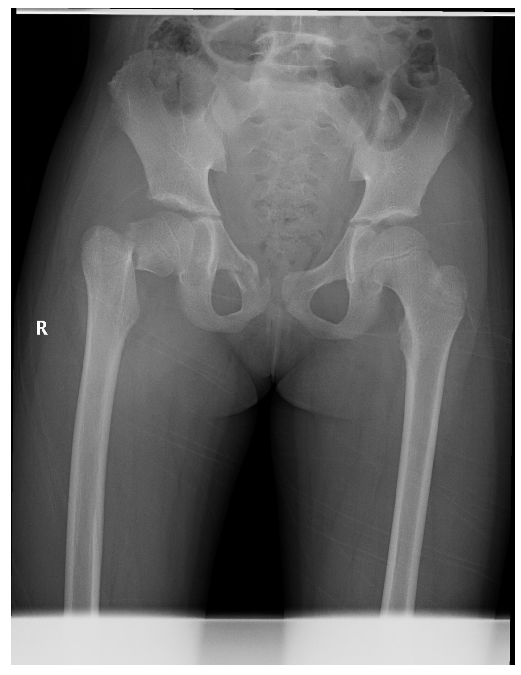
Fig 1. Fracture classification and displacement degree. Radiograph showing a Delbet type-III femoral neck fracture with significant displacement.