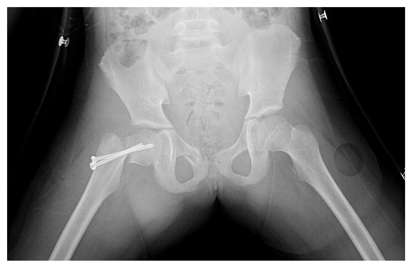
Fig 2. Reduction quality. Unsatisfactory reduction: The widest distance of the fracture ends is obvious (more than 10mm); the diaphragm is poorly aligned (more than 10°).