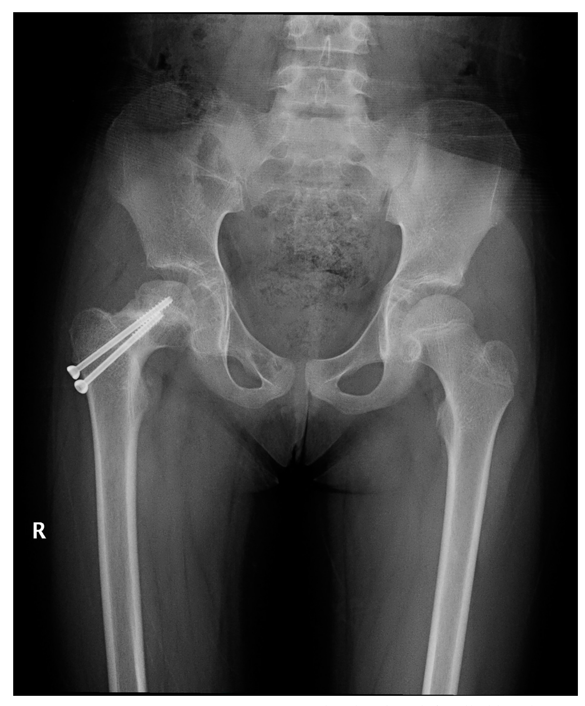
Fig 3. The last follow-up evaluation at 12 months postoperatively. Radiograph reveals irregular femoral head shapes, changes in density, and the presence of avascular necrosis of the femoral head.

independent and random. Setting three groups, including direct closed, direct open, and open surgery groups after closed failure, may be a better categorization. However, this would require a large sample size. There were only 28 cases in this study, and most parents refused direct open surgery. Therefore, we did not thoroughly study this aspect.