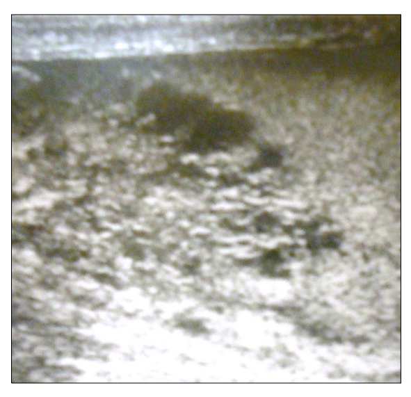
FIG. 1. Scrotal ultrasonography: well-circumscribed area containing multiple minute cysts with echogenic foci occupying almost one-third of the left testicular parenchyma.