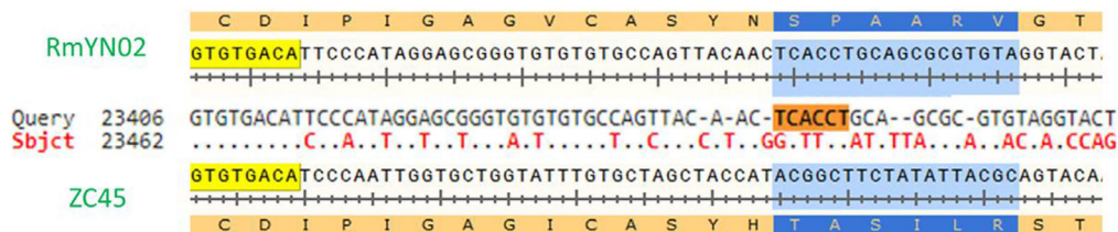
FIGURE 2 Alignment of nucleotide and amino acid sequences of the S protein from bat-SL-CoVZC45 (MG772933.1) and RmYN02 at the S1/S2 junction site. No insertions of nucleotides possibly evolving in a furin cleavage site can be observed (in blue)

spike protein of SARS-CoV-2 of a cleavage site activated by a host-cell enzyme furin, previously not identified in other beta-CoVs of lineage b [36] and similar to that of Middle East respiratory syndrome (MERS) coronavirus. [35] Host protease processing plays a pivotal role as a species and tissue barrier and engineering of the cleavage sites of CoV spike proteins modifies virus tropism and virulence. [37] The ubiquitous expression of furin in different organs and tissues have conferred to SARS-CoV-2 the ability to infect organs usually invulnerable to other CoVs, leading to systemic infection in the body. [38] Cell-cultured SARS-CoV-2 that was missing the above-mentioned cleavage site caused attenuated symptoms in infected hamsters, [39] and mutagenesis studies have confirmed that the polybasic furin site is essential for SARS-CoV-2's ability to infect human lung cells. [40]