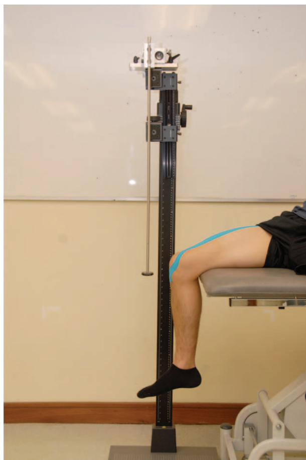
FIGURE 2. Subject and the reflex jig positioned for testing.

The knee extensor peak torque was evaluated using isokinetic dynamometer (Cybex Humac Norm, CSMI version 2.04, Stoughton, MA, USA). The subject was seated in the dynamometer chair with the hips in 85° flexion and the knees in 90° flexion. The knee joint was aligned with the axis of the dynamometer. The subject's torso and the thigh were firmly