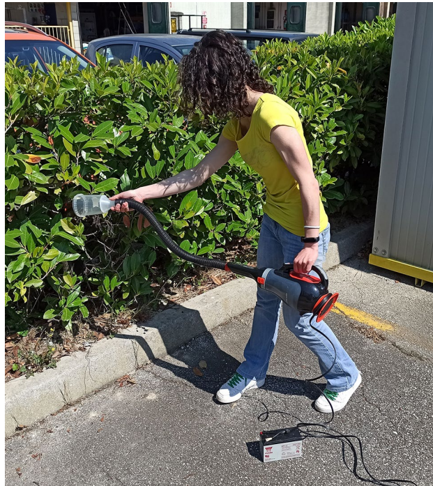
Figure 3. Home-built handheld aspirator (a modified handheld vacuum).

200-m radius of the sampling site, corresponding to the average flight distance of Ae. albopictus recorded in a study conducted in Italy 46 . The survey was carried out once in 2020. Residents were asked if they owned animals (dogs, cats, farm animals) and how many they had or, where possible, they were counted directly by the study team (visual inspection). The presence of wild ungulates was estimated according to data provided by the Forestry and Fauna Service—Wildlife Office of the Autonomous Province of Trento. The wild ungulate census was carried out in spring by visual inspection along transects, and repeated three times by hunters and personnel of the wildlife management provincial office. 47 The average number of roe deer, red deer, and chamois in 2020 was considered for the analyses. Collected information was used to qualitatively estimate potential host availability in the sampling areas. Human population density in the areas surrounding the sampling point was estimated using the Global Human Settlement Database (GHS Data) 48 .