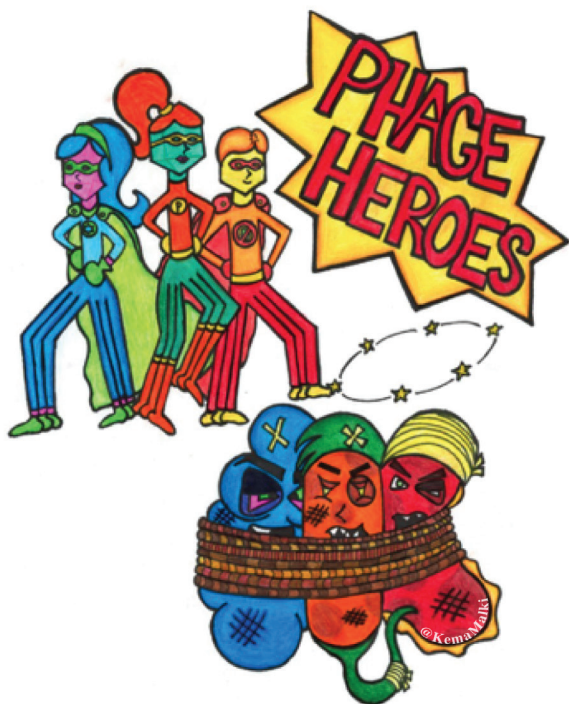
FIGURE 1. The team of phage heroes conquering their bacterial villains (artwork by Kema Malki). This design can be used to make custom temporary tattoos to serve as a reward for successfully capturing the correct bacteria in the outreach activity.