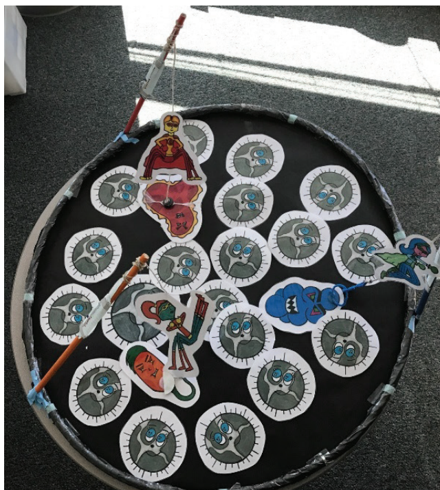
FIGURE 2. Example illustrating the set-up of the outreach activity. The diameter of the hula hoop in this photo is \sim 1 meter with all heroes and villains printed full-scale from the appendices. This activity can be modified for smaller learning spaces by using a paper plate instead of a hula-hoop and reducing the size of the bacterial colonies and phage heroes accordingly.