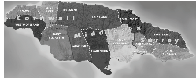
Key Counties Cornwall (Hanover, St. Elizabeth, Saint James, and Westmore land) Middlesex (Clarendon, Manchester, St. Ann, St. Catherine, and St. Mary) Surrey (Kingston, Portland, St. Andrew, and St. Thomas) Boundaries --- Parishes — Counties Miles 0 20