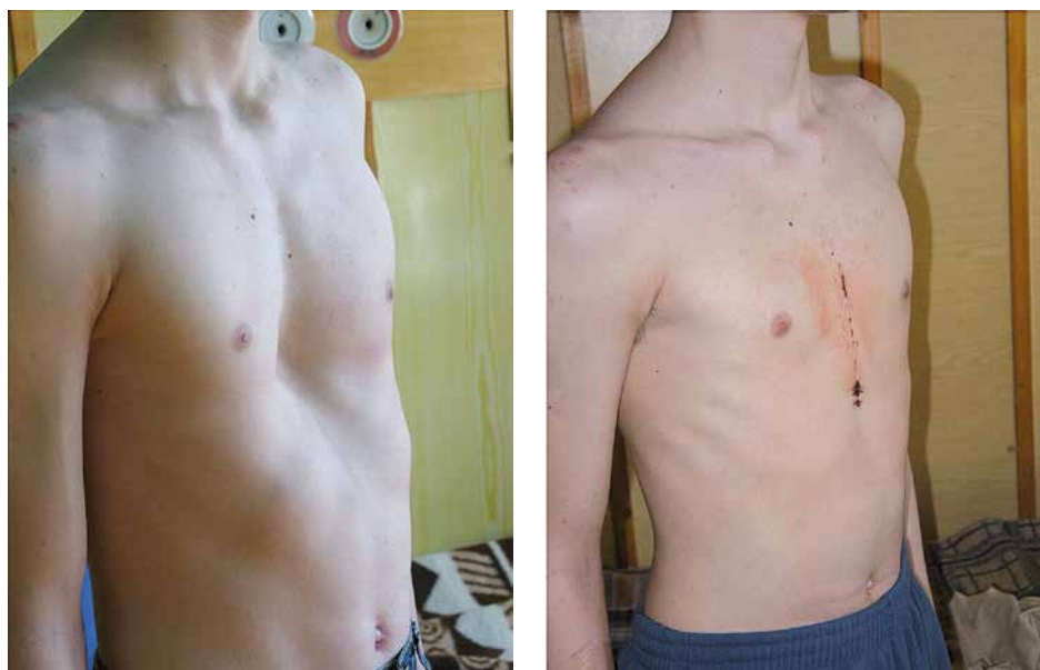
Figure 2. Photograph of the patient's anterior chest wall before and after pectus excavatum surgery