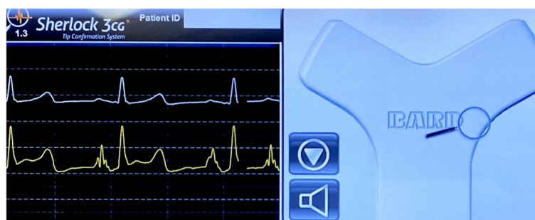
Fig. 2 Body surface (left, top) and intracavity (left, down) electrocardiogram and an image on the display (right). Intracavity electrocardiogram was monitored via the peripherally inserted central catheter (PICC). Amplitude of the P waves is increased with advancing the PICC catheter and become highest with the tip located at the cavoatrial junction. Location of the tip of the PICC and the direction of the catheter are shown by a circle and a line, respectively, on the display