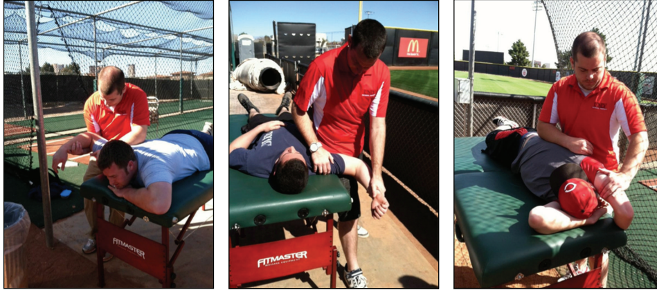
FIGURE 2: Demonstration of each stretch included in the stretching protocol. Left to right: pectoralis major stretch, subscapularis stretch, and latissimus dorsi stretch.