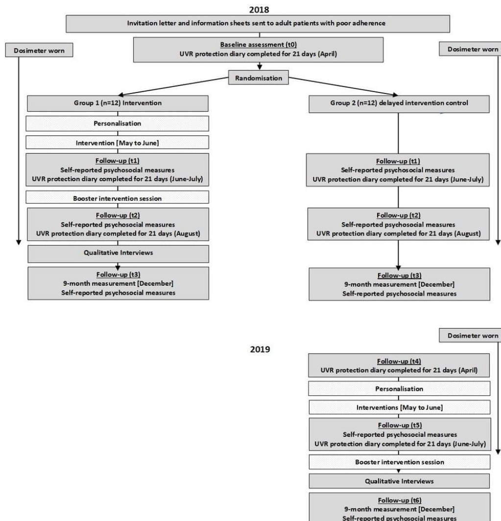
Figure 1 Progression of participants through the study.

Patient flow through the study is described in figure 1. The baseline assessment takes place in April 2018 (t0). Post-randomisation assessments take place after completion of the intervention in June to July 2018 (t1), after a booster session in August 2018 (t2) and after a long-term follow-up in December 2018 (t3). All participants use a wrist-worn UVR dosimeter continuously from t0 to t2 and complete daily UVR protection diaries for 21 consecutive days at each assessment time point. At each assessment, participants additionally complete patient-reported outcomes. The t3 follow-up does not involve dosimetry