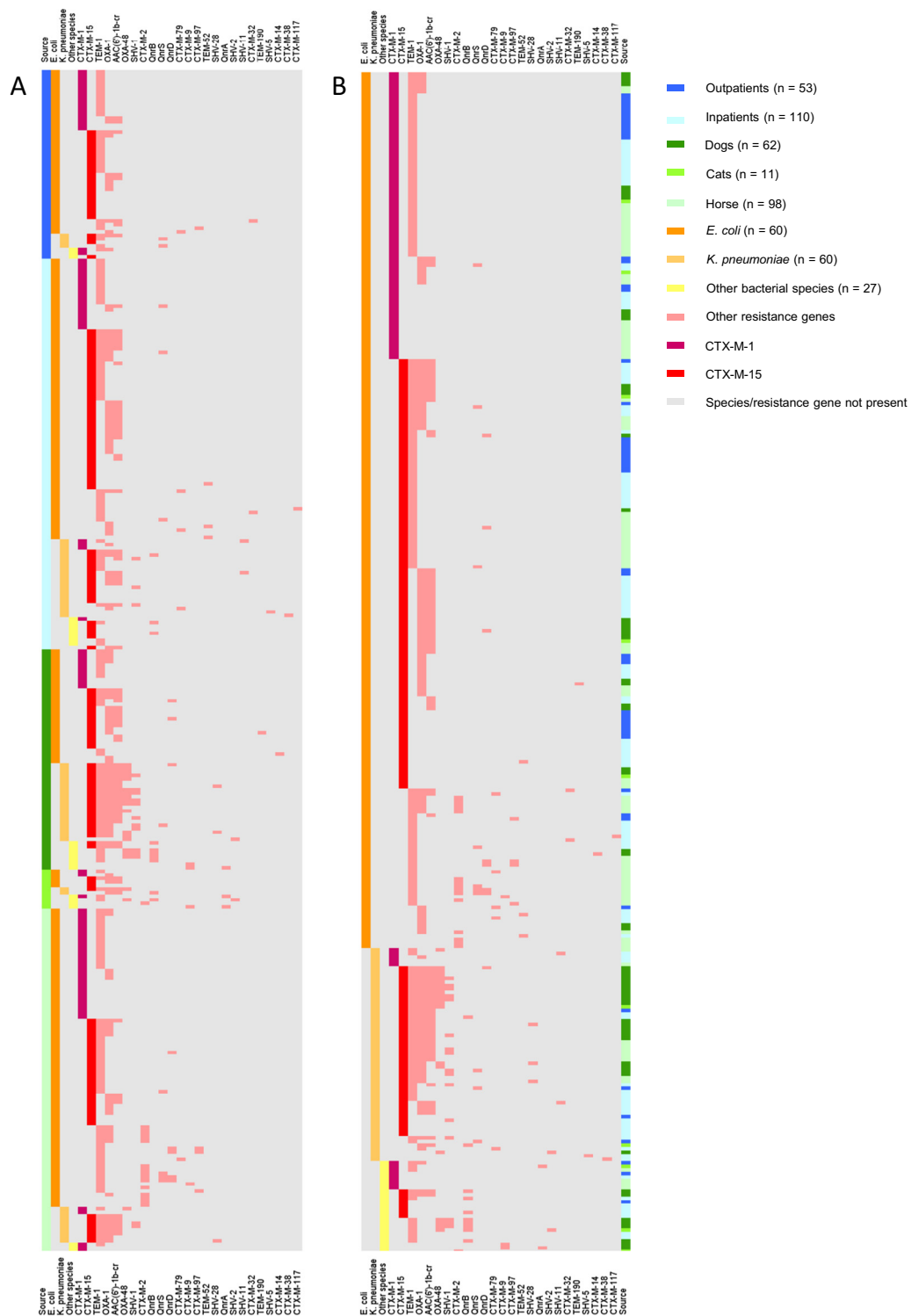
Figure 1 Heat maps generated from identified resistance genes and bacterial species among human and animal isolates. Identified resistance genes and bacterial species are listed according to frequency (except for CTX-M-1 and CTX-M-15) on the right and left side of the figures. Source = origin of isolates (outpatients, inpatients, dogs, cats, horses). Not included are isolates without detectable resistance gene (n = 28). The term "Other species" includes Enterobacter cloacae (n = 12), Klebsiella oxytoca (n = 9), Enterobacter intermedius (n = 2), Enterobacter gergoviae (n = 1), Citrobacter freundii (n = 1) and Proteus mirabilis (n = 1). A is focussing on the origin of isolates whereas the B emphasizes the involved bacterial species.