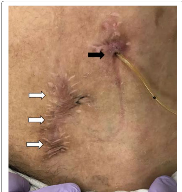
Fig. 3 Appearance one and a half years after the operation. The exit for intestinal tube (black arrow) and the wound after closure of the ACE procedure that used a balloon-button gastrostomy tube (white arrow)