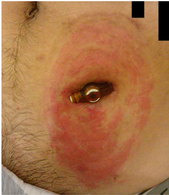
Fig. 1 The ACE procedure using a balloon-button gastrostomy tube and skin findings just before reconstruction. Dermatitis was observed around the gastrostomy tube

shaft length, and covered with a stoma pouch to reduce skin irritation. However, his QOL declined due to the need for frequent pouch replacement. Thus, we decided to reconstruct the ACE procedure again using MM.