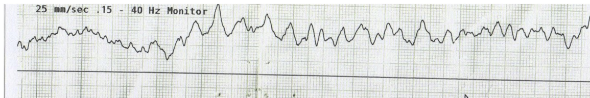
Fig. 1. ECG showing ventricular fibrillation.