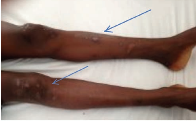
Figure 1. On both legs there were multiple excoriated papular lesions.