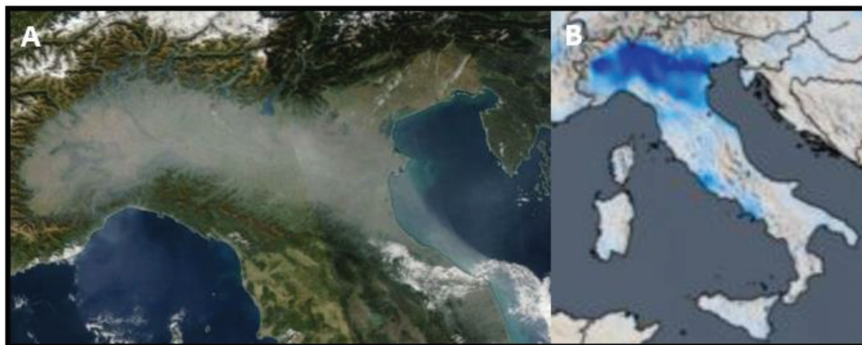
Figure 1 | (A) Photo showing the smog on Pianura Padana. (B) Intensity and distribution of nitrogen dioxide tropospheric column (blue color).