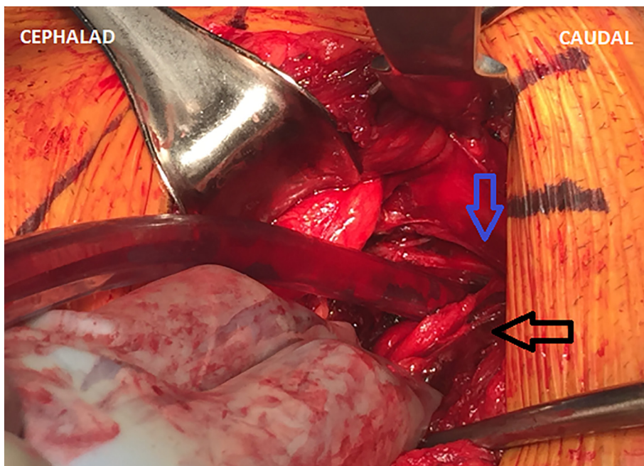
Fig. 2. Intra-operative photograph showing the bladder trapped in the fracture site of the left superior pubic ramus. (Blue arrow = fracture. Black arrow = bladder.) (For interpretation of the references to colour in this figure legend, the reader is referred to the web version of this article.)

The patient was taken to the operating room the next day for open reduction and internal fixation of his pelvis fracture with release of the entrapped bladder (Fig. 2). After careful dissection, a Cobb elevator was used to pry the left superior pubic ramus fracture apart, and the bladder was teased free from the fracture site. A tear in the bladder wall extending into the muscularis layer but not through the mucosa was repaired with absorbable sutures in a mattress pattern. The fracture site was irrigated and fixed with a small fragment reconstruction plate. Percutaneous fixation of the posterior pelvic ring injury was performed with a sacroiliac screw (Fig. 3). The patient was given peri-operative antibiotics per routine and discharged with the Foley in place for two weeks, toe-touch weightbearing on the affected extremity. Two weeks after surgery, repeat cystogram demonstrated no active extravasation from the