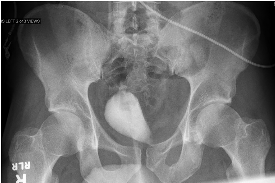
Fig. 1. Residual contrast in the bladder shows bladder entrapment by the left superior pubic ramus fracture on this AP pelvis X-ray.

demonstrated entrapment of the bladder in the left superior pubic ramus fracture with no contrast extravasation, and residual contrast in the bladder showed the entrapment on plain film (Fig. 1).