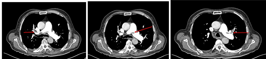
FIGURE 3: Axial CT scan of the chest for confirmation of the saddle pulmonary embolism

Nausea, vomiting, and cough improved during the hospital stay. The nausea and vomiting were attributed to gastroesophageal reflux disease (GERD) vs. hepatic metastasis. The cough was attributed to a change in season vs. upper respiratory infection vs. GERD as the patient did not have a fever or an elevated white blood cell count. The patient was placed on Eliquis 10 mg twice a day (BID) for the first seven days and 5 mg BID for the next 14 days as per the hematology-oncology specialist.