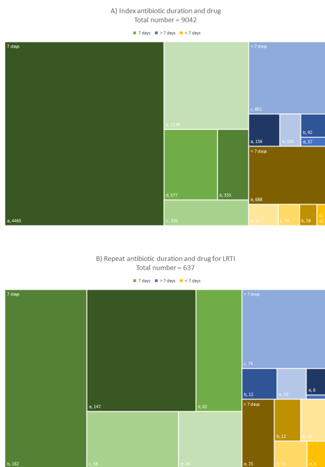
Figure 2 Treemap chart of antibiotic duration and drug of (A) index prescriptions and (B) repeat prescriptions for LRTI. Absolute numbers presented. Missing data due to missing duration (127 cases). a, amoxicillin; b, erythromycin/clarithromycin; c, doxycycline; d, co-amoxiclav; e, other; LRTI, lower respiratory tract infection.

(28.7%, 27.3% and 25.8%, respectively, see figure 2B ). Most second-line prescriptions were for 7, 8 or 5 days (73.5%, 9.8% and 8.6%, respectively). The median for repeat antibiotic course duration was 7 days. A total of 127 cases had no documented second-course duration.