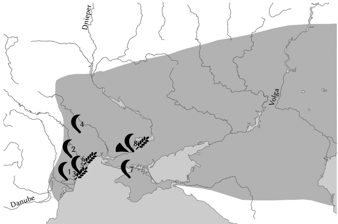
Fig 3. Cereal remains, cutting tools and a plowshare alleged to be found in Yamnaya contexts. The shaded area indicates the extent of the Yamnaya culture at the end of the Copper Age [18:651]. Sites: 1 Kholmske; 2 Gura-Bykuluy; 3 Glubokoe; 4 Tetskany; 5 Alkaliya; 6 Belyaevka; 7 Rysove; 8 Mikhailovka; 9 Skelya-Kamenolomnya. Cutting tool data from Razumov [162] and Ivanova [39], plowshare data from Gimbutas [214:161], and cereal data from Pashkevich [36:15] and Anthony [3:320].

https://doi.org/10.1371/journal.pone.0275744.g003