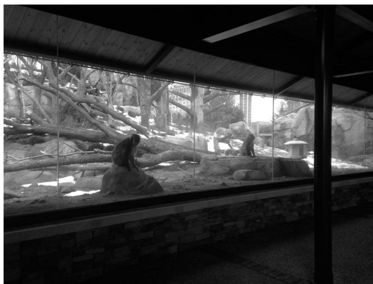
Figure 2. Section of the North viewing window of the Japanese macaque exhibit.