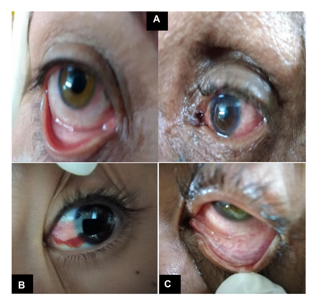
\label{eq:Figure 2} Figure \ 2 \ (A) \ Follicular \ conjunctivitis. \ (B) \ Subconjunctival \ hemorrhage. \ (C) \ Conjunctival \ hyperemia.