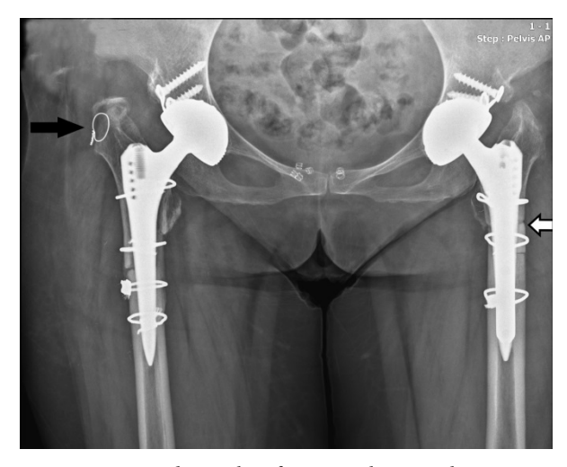
Figure 2. X-ray radiography of patient whose trochanter major fracture (black arrow) was repaired with cerclage with a fracture that developed in the intraoperative osteotomy line (white arrow).