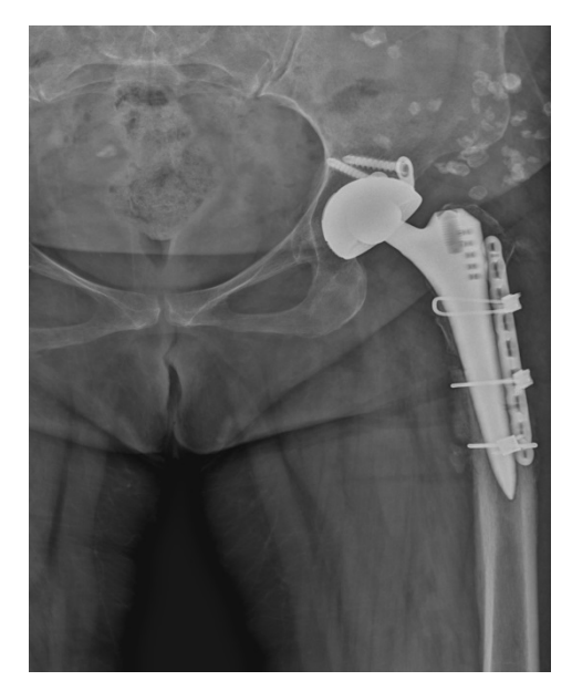
Figure 4. X-ray radiograph of patient who underwent osteotomy fixation with plate and cable after union.

be evaluated. In order to achieve good postoperative results, the most appropriate surgical treatment should be applied to normal anatomical points. The first important problem to be tackled in cases of Crowe type 3–4 DDH is the optimal placement of the acetabular cup for the restoration of the rotation center. Although some studies reported good results with the placement of the cup in the new acetabulum [17,18], the best outcomes in terms of the length of the leg, stability, and biomechanical results are obtained by placing the cup in the original acetabulum