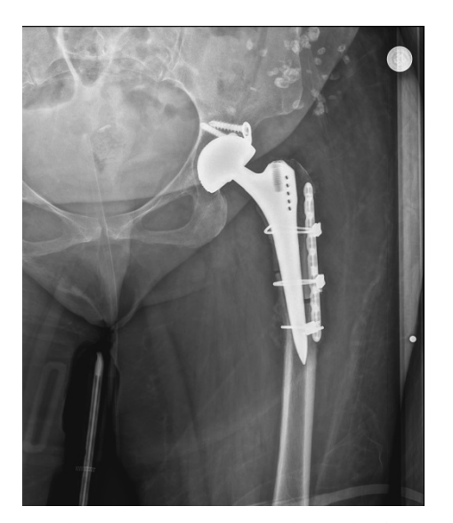
Figure 3. Early postoperative X-ray radiograph of patient who underwent osteotomy fixation with plate and cable.

be evaluated. In order to achieve good postoperative results, the most appropriate surgical treatment should be applied to normal anatomical points. The first important problem to be tackled in cases of Crowe type 3–4 DDH is the optimal placement of the acetabular cup for the restoration of the rotation center. Although some studies reported good results with the placement of the cup in the new acetabulum [17,18], the best outcomes in terms of the length of the leg, stability, and biomechanical results are obtained by placing the cup in the original acetabulum