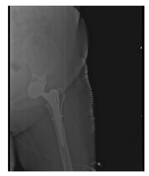
Figure 6. Postoperative X-ray radiograph of patient who underwent osteotomy fixation with only a cable.

allows the restoration of a more normal limb length with good clinical outcomes, a low rate of neurological and other complications, and high prosthesis survival rates.