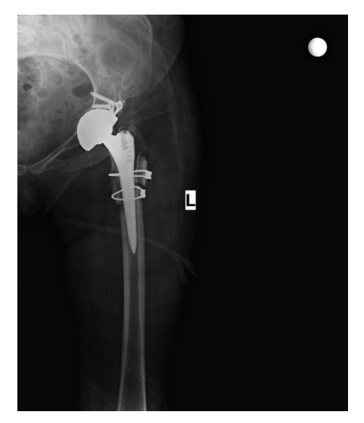
Figure 5. Postoperative X-ray radiograph of patient who underwent osteotomy fixation with cable and onlay strut graft.

In conclusion, subtrochanteric shortening Z-osteotomy combined with cementless total hip replacement can be considered an effective and successful method in selected patients with Crowe type 3–4 coxarthrosis. This procedure