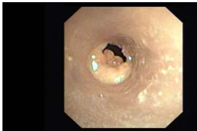
Figure 2 Granulation tissue obstructing distal end of silicone tracheal (Dumon®) Dumon stent.

ing in a smaller internal diameter in most cases [7]. Silicone stent-specific complications have raised the question of whether metallic stents might overcome some of these difficulties.