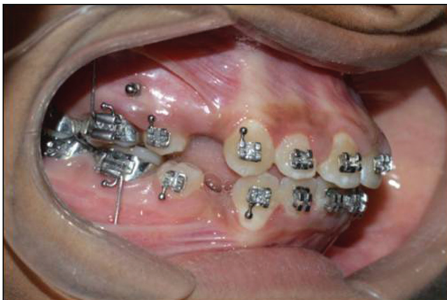
Figure 3: Mini-implants in position

The pre- and the posttreatment cephalograms were superimposed using Bjork's20 method. The tracings were superimposed by registering on the best fit of anterosuperior border of the chin and corpus axis. The distance from the sella vertical to the vertical lengths of