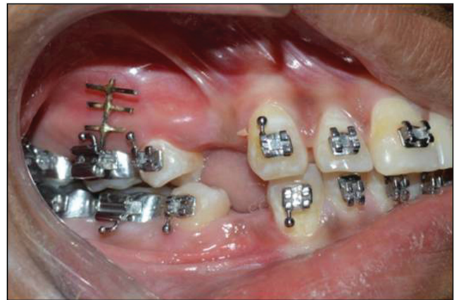
Figure 1: Surgical stent in maxilla

The implant used in this study was a mini-screw (3M Unitek, Irwindale, California, MN 55144-1000USA) having a diameter of 1.5mm and a length of 8mm, which could withstand as much as 450g of force, whereas most orthodontic force applications need less than 300g of force. The implant site was marked using a 0.019" × 0.025" stainless steel stent [Figure 1], and its position was confirmed with the help of an intraoral periapical radiograph [Figure 2]. Local anesthetic agent was infiltrated at the site of implant placement. The