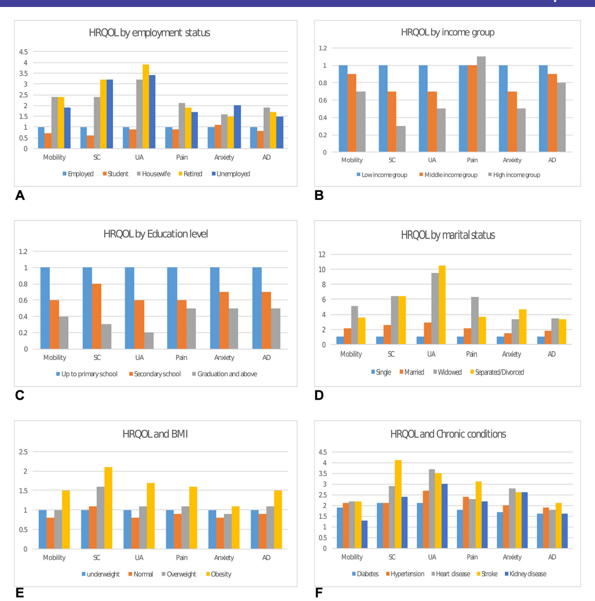
Figure 2 PR of moderate or severe health problems by sociodemographic factors and chronic conditions. (A) Shows the PR of moderate or severe difficulties in EQ5D domains (mobility, self-care, usual activities, pain/discomfort, anxiety/ depression and any of the five dimensions) by employment status. With reference to those who were employed (PR=1), housewife, retired and the unemployed reported greater problems in all five domains, whereas students only reported higher anxiety problems compared with employed. (B) Shows the PR of moderate or severe difficulties in EQ5D domains by income group. With reference to low-income group (PR=1), those in middle-income or high-income groups had less problems in all five domains. (C) Shows the PR of moderate or severe difficulties in EQ5D domains (mobility, self-care, usual activities, pain/discomfort, anxiety/depression and any of the five dimensions) by education level. With reference to those primary school education (PR=1), individuals with secondary school or graduates reported significantly lower problems in all five domains. (D) Shows the PR of moderate or severe difficulties in EQ5D domains by marital status. With reference to single (PR=1), those who were married, widower or divorcee had greater problems in all five domains. (E) Shows the PR of moderate or severe difficulties in EQ5D domains (mobility, self-care, usual activities, pain/discomfort, anxiety/depression and any of the five dimensions) by BMI. With reference to underweight, that is, BMI <18 kg/m<sup>2</sup> (PR=1), individuals who are overweight (BMI 25-29.9 kg/m²) or obese (BMI ≥30 kg/m²) reported significantly greater problems in all five domains. (F) Shows the PR of moderate or severe difficulties in EQ5D domains by chronic conditions. Compared with those without chronic conditions, individuals with self-reported diabetes, hypertension, heart disease, stroke and kidney disease had twice greater problems in all five domains, AD, any dimension; BMI, body mass index; EQ5D, European Quality of Life Five Dimension; HRQOL, health-related quality of life; PR, prevalence ratio; SC, self-care; UA, usual activities.

which is consistent with results reported from other studies done in China, Thailand and Western populations. <sup>28 33–36</sup> Since the respondent's health status could be