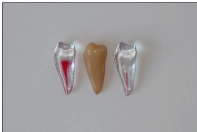
Figure 2. Transparent and opaque 3D printed replicas with varying degrees of pulp canal obliteration