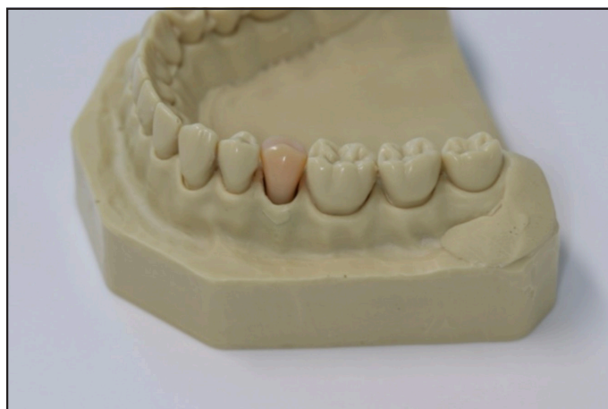
Figure 3. Opaque training tooth placed on the model, which was mounted in a dental dummy for access cavity preparation