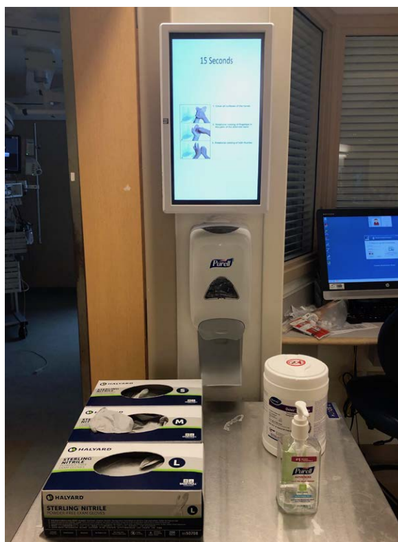
Fig. 2. Bedside screens for just-in-time display of HH audit results, information and motivational messages.

groups achieved >90% compliance; the groups sustained this rate for 11 months. Overall, HH compliance for the unit during the post-intervention period was 93%. We have shown the average compliance for each month of the study period in a control chart with annotation in Figure 3. The mean line was shifted for the intervention and post-intervention period based on special cause variation rule of 8 points above the average. 4